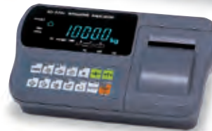
With optional built-in printer