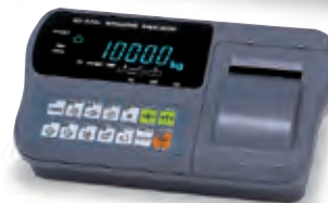
With optional built-in printer